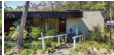
4BR | 3BA | 2713sqft | 0.2ac 7 offers, Sleepy Hollow Fixer