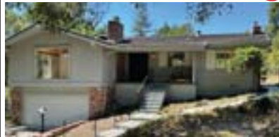
4BR | 2BA | 1880sqft | 0.5ac 7 offers, Orinda Oaks